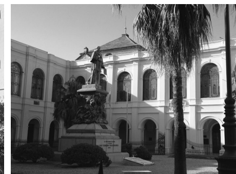
From top to bottom and from left to right: Universidad de Oviedo (Spain), Polytechnic University of Prague (Czech Republic), Université Cheikh Anta Diop (Senegal), University of Kagoshima (Japan), Université de Sfax (Tunisia), Universidad Nacional de Córdoba (Argentina)