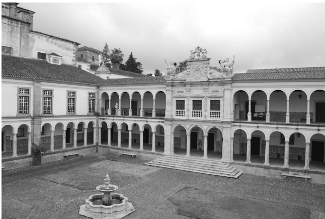
👉 From top to bottom: Université Paris 1 Panthéon-Sorbonne (France), Università degli Studi di Padova (Italy), Universidade de Évora (Portugal)