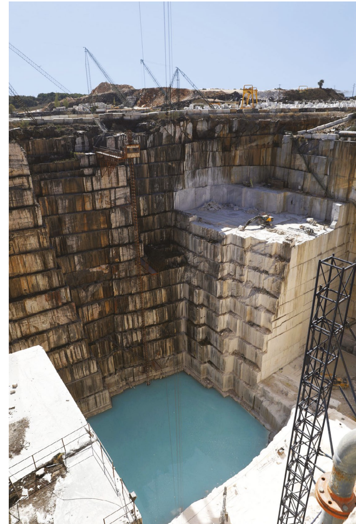
📍 Marble quarry, Villa Viçosa, Portugal

Mutual teaching is practised for languages (French conversation classes) and field work (visits organised and conducted by students). ●